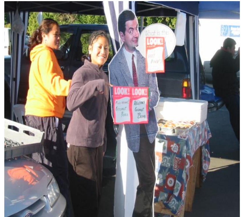
Kai Malie Foods Ltd